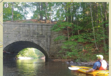
Large arch railroad bridge over the Mousam River

Mousam Way South Mousam Way South is a lovely woods trail that follows the Mousam River from Emery Street to School Street and features a 300-foot boardwalk across a wetland.