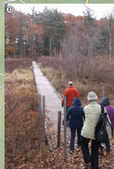
Boardwalk at Mousam Way South