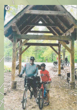
Bikers at post and beam structure on William Oscar Emery Drive