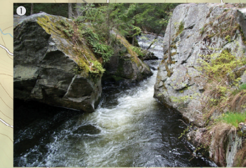
Indian's Last Leap