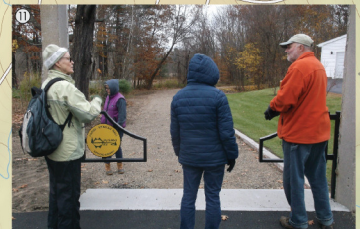
Boston Avenue trail arthropos with granite columns