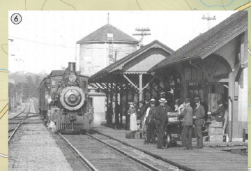
Springvale Railroad Station, early 1900s