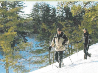
Skiers showing along the Mousam River