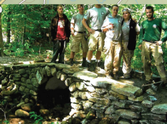
Stone bridge with AmeriCorps participants