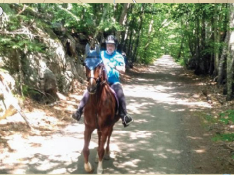
Seaback rider on Sanford Springvale Rail Trail